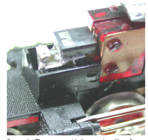
figure 4: The component in its correct position after being pushed in completely