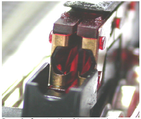
figure 2: Correct position of the contact sheets