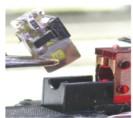
figure 3: Correct installation of the component