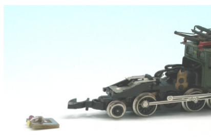
figure 2: Correct position of the contact sheets