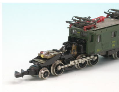
figure 3: Correct installation of the component