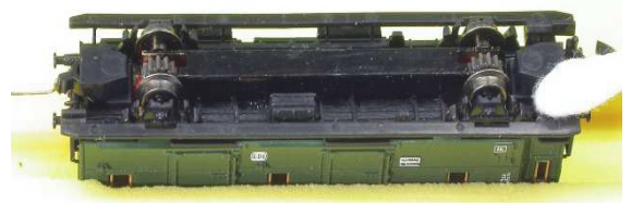
figure 4: Cleaning of the bearing surfaces