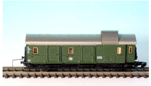
figure 1: Donnerbüchsen luggage car as a ghost car

High Tech Modellbahnen 97456 Hambach www.z-hightech.de