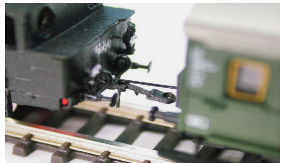
figure 3: Coupling with a newer coupler hook