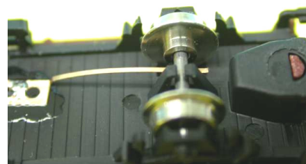
figure 7: The uninsulated side—always on the side where the current collector is located. Very important!