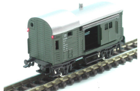
figure 1: Red backlights in a package car