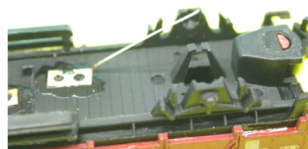
figure 8: The correct position of the current collector without the axle