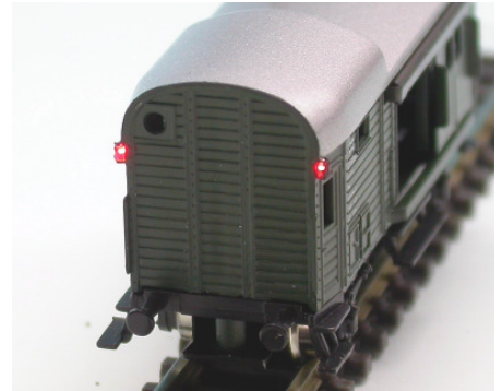
figure 2: A closer look at the backlights