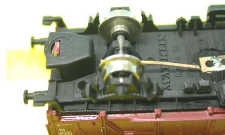
figure 6: The insulated side of the wheel, turned to the opposite direction of the current collector