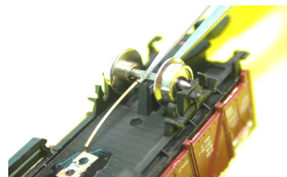
figure 4: Pushing the axle into the clamp with the help of some tweezers.