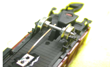
figure 3: The axle ready to be built in, lying on top of the clamp

High Tech Modellbahnen 97456 Hambach www.z-hightech.de