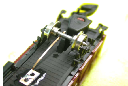
figure 3: The axle ready to be built in, lying on top of the clamp

High Tech Modellbahnen 97456 Hambach www.z-hightech.de