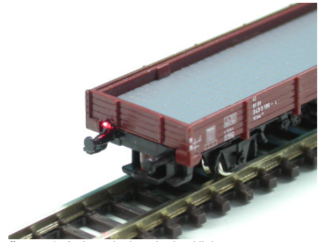
figure 2: A closer look at the backlights