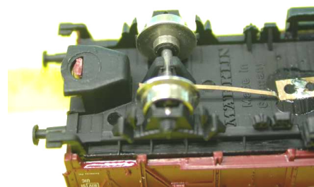
figure 6: The insulated side of the wheel, turned to the opposite direction of the current collector