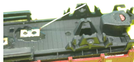
figure 8: The correct position of the current collector without the axle