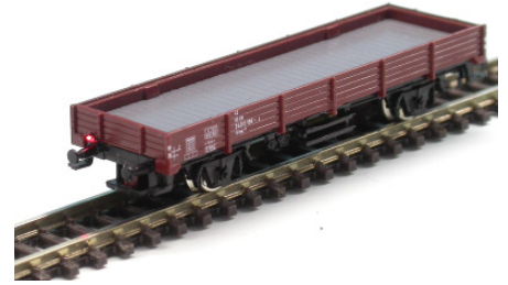
figure 1: Red backlights in a flat car