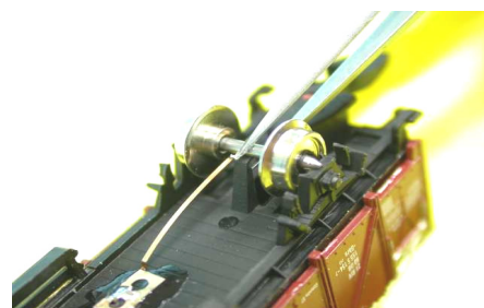
figure 4: Pushing the axle into the clamp with the help of some tweezers.