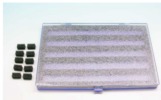
figure 1: The transport box for track gage Z with 10 foam cubes enclosed