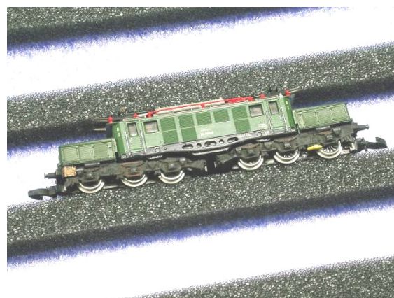
figure 3: Put the vehicle into the box with its pantographs first, then carefully push in the wheels – like this nothing should be damaged