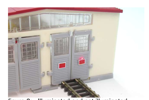
figure 3: Illuminated and not illuminated – affixed to the doors of the engine shed