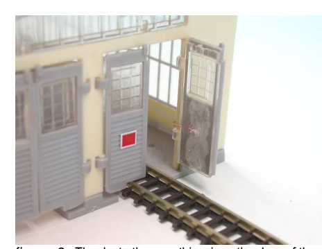
figure 6: Thanks to the very thin wires, the door of the shed can still be opened without any problem