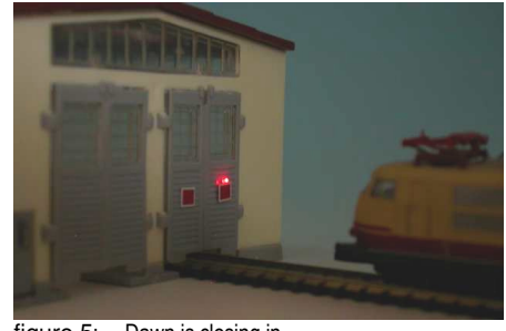
figure 5: Dawn is closing in...