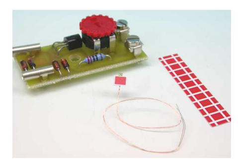
figure 1: Illuminated safety stop signal with a connecting component for regulation of the brightness, and with 10 further warning signs to be cut out included