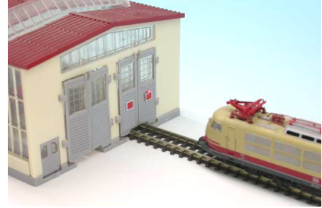
figure 4: A great effect- more may not be said about this